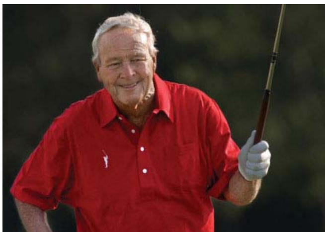
Arnold Palmer tees off ceremony for new Lonnie Poole Golf Course at NC State University.

The golf course is slated to open in spring 2009.